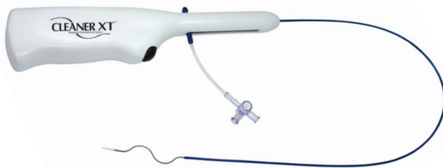
Fig 1. Cleaner XT™ Rotational Thrombectomy Device.

Research databases such as Embase ( embase.com ) and Research Gate ( researchgate.com ) were utilized for performance of initial research review. Search parameter words such as Cleaner, Cleaner XT™, thrombectomy, complications, and patency were utilized in the search engine to identify suitable research articles discussing the used of mechanical rotational thrombectomy utilization in the dialysis access circuit. Once appropriate studies were identified, initial data was scrubbed to identify the studies that included post procedure patency rates, procedural times, and cited procedural or post procedural complication data. Four studies stood out with regards to having all the parameters for evaluations after data scrub was performed for comparative benchmarks.